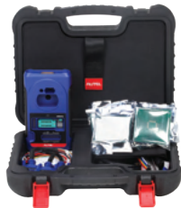
ADVANCED ALL-IN-ONE KEY PROGRAMMER

ADD EUROPEAN VEHICLE COVERAGE TO YOUR IM508 OR IM608 WITH THE XP400PRO